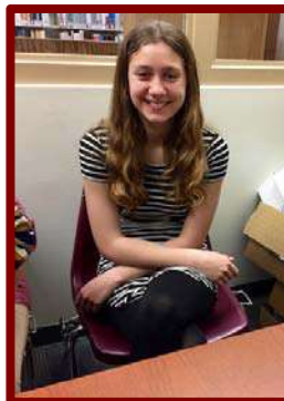
Cherokee Orupt Edendale