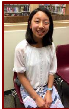
Laura Lee Canyon