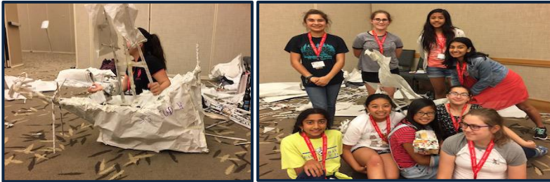
The good ship Judy H.!

Every year for the past 4 years, the girls are given a challenge from a civil engineer: design and build a structure made out of newspapers only. Each dorm group decides on its structure and designs it. The adults may help with preparing the building supplies and keeping the girls in newspapers and nothing else. The girls have the week to work on the structure in their spare time, but it must actually be built Friday evening at the culminating event of camp. It is a wild fun evening with girls building Ferris wheels, thrones, stadiums, a boat or two and even a camp complete with campfire.