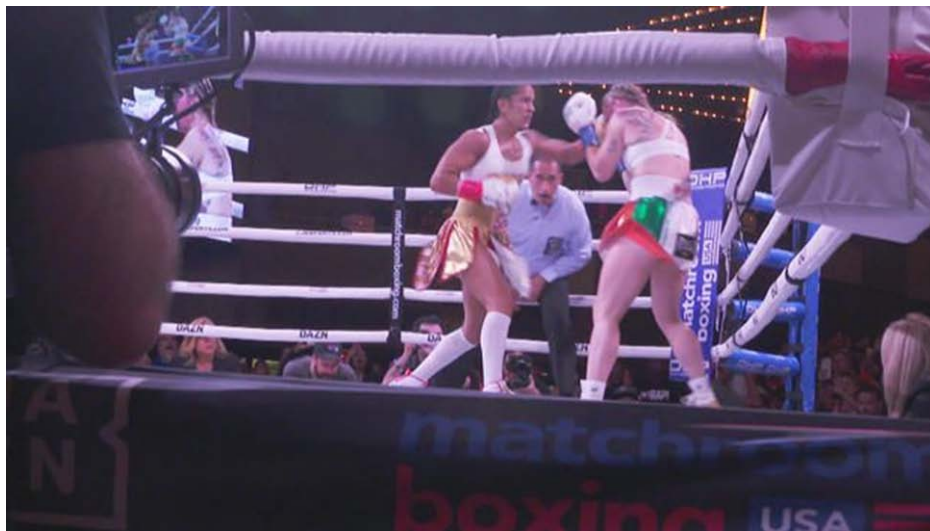
Amanda Serrano and Heather Hardy fight for WBO featherweight title.

Two of the biggest names in women's boxing – Heather Hardy and Amanda Serrano – have known each other for years. But recently, when they climbed into the ring at the Theater at Madison Square Garden, in New York City, they weren't thinking about their friendship.