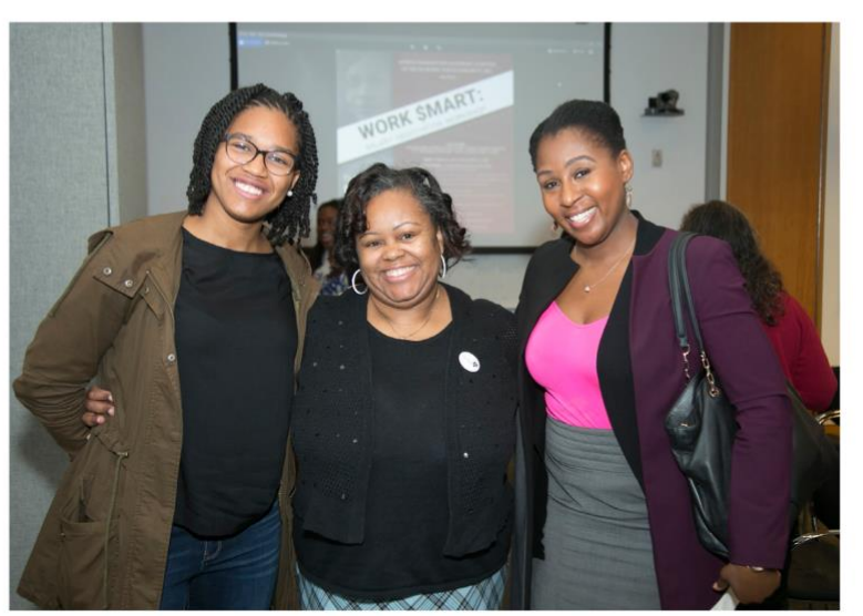
Millions of women will benefit from salary negotiation workshops through our expanding AAUW Work Smart program.

We are proud of the progress that 137 years in the women's empowerment field has earned us. We're even prouder of the energetic and determined community we've become thanks to committed individuals like you.