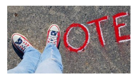
AAUW National Presents